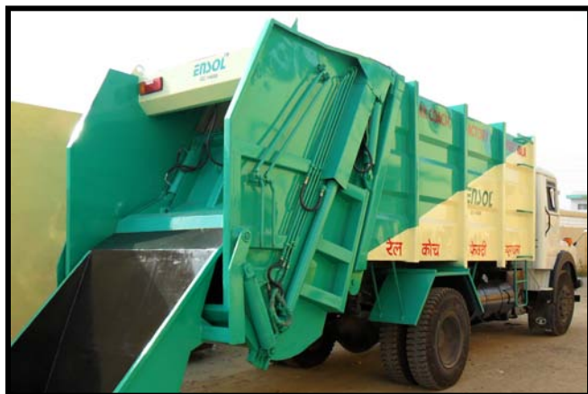
Ensol GC1400 with additional Bucket

For Collection of Garbage / Solid Waste Capacity Range 6 CuM., 8 CuM. & 14 CuM.