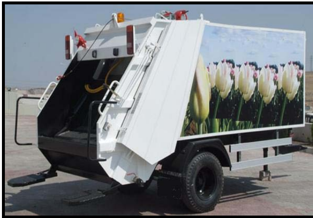
Ensol TGC700 on Trailer

Easy to handle and will allow the loading personnel to operate the vehicle with minimum physical effort and maximum safety. The vehicle is capable of unloading garbage from containers of 120 to 1300 Litres capacity as per DIN standard.