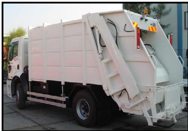
Ensol GC1400 for Export Customer