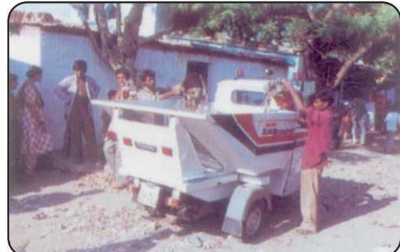
Collection from Lanes / Societies