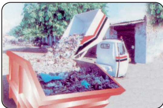
Emptying directly in Container / Refuse Collector