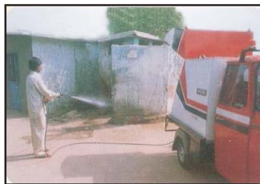
Public Urinals / Toilets Cleaning