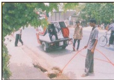
Drainage / Sewer Line Cleaner