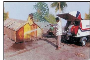
Container / Vehicle washing