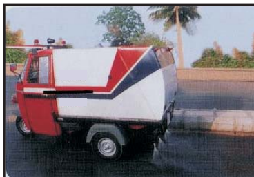
Road / Street Washing