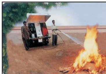
Small Fire Extinguishing